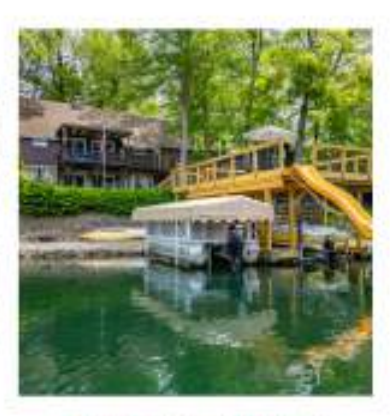
REPRESENTED BUYER & SELLER