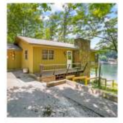
REPRESENTED SELLER SOLD OVER LIST PRICE IN 12 HOURS