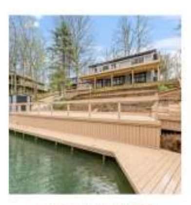
REPRESENTED BUYER & SELLER