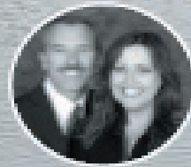
Hoosier Home Team 317-739-4239

Choose the real estate company with a local office and an international reach.